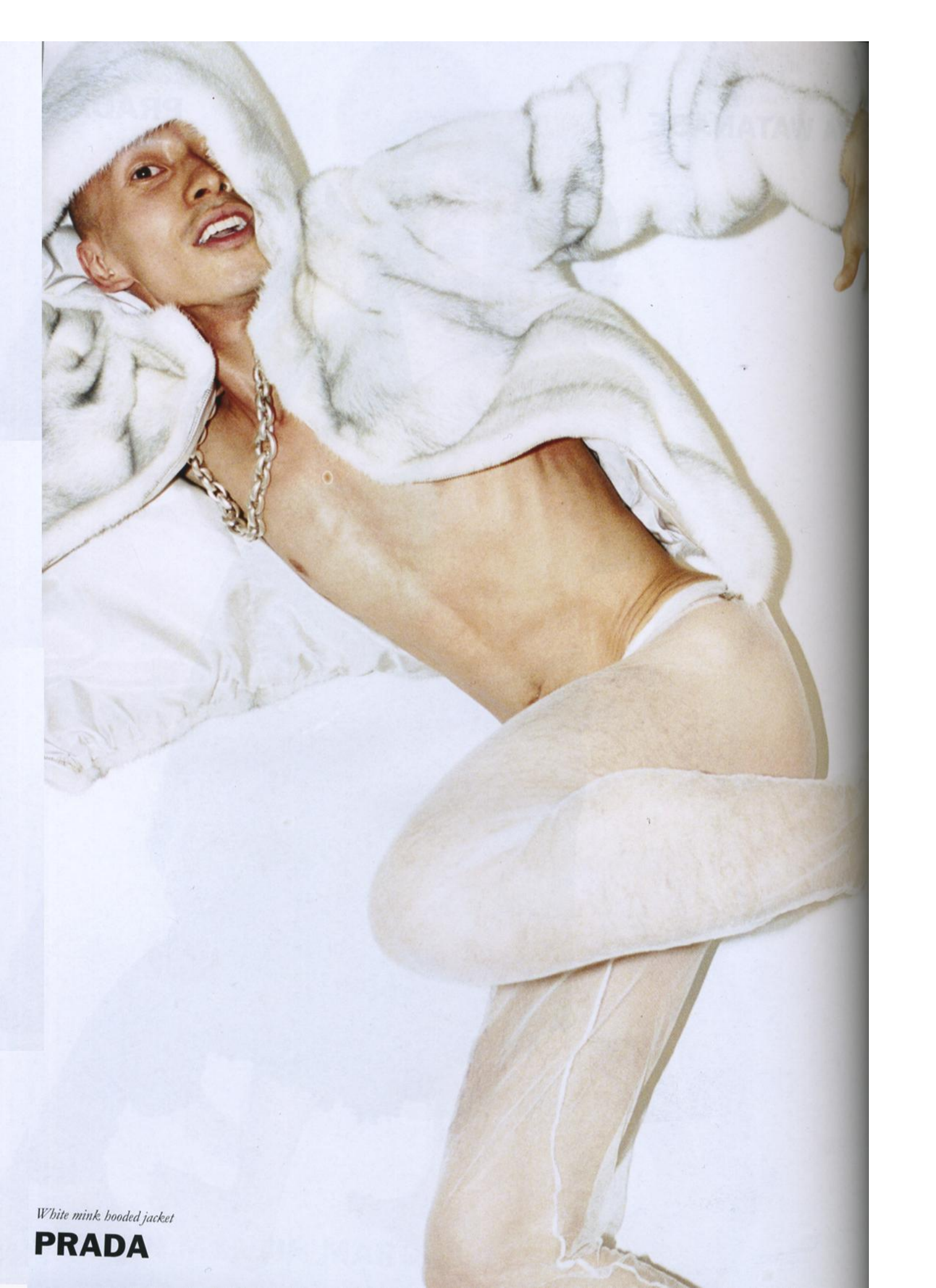
White mink hooded jacket